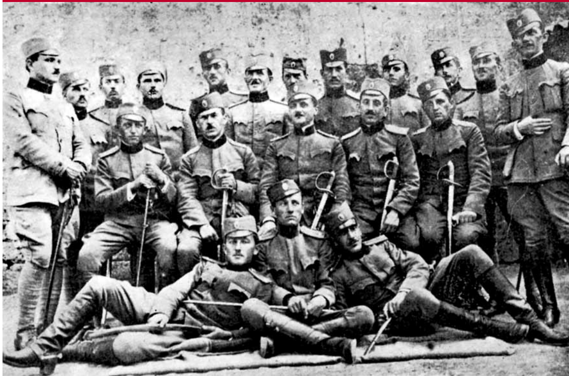
Značilne fotografije slovenskih dobrovoljcev srbske vojske 1914–18 Typical photos of Slovenian volunteers serving in the Serbian army in 1914–1918

ujetniška taborišča in agitiranje za vstop med srbske dobrovoljce, potovanje po Sibiriji in dolgotrajna vožnja z ladjo iz Vladivostoka do Dubrovnika, preboj solunske fronte in podobno). To so obdobja: